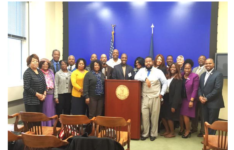
2017 VSC NAACP Lobby Team members and some of the Lobby Day participants after the NAACP Lobby Day Press Conference held in the Virginia General Assembly Building's Press Room